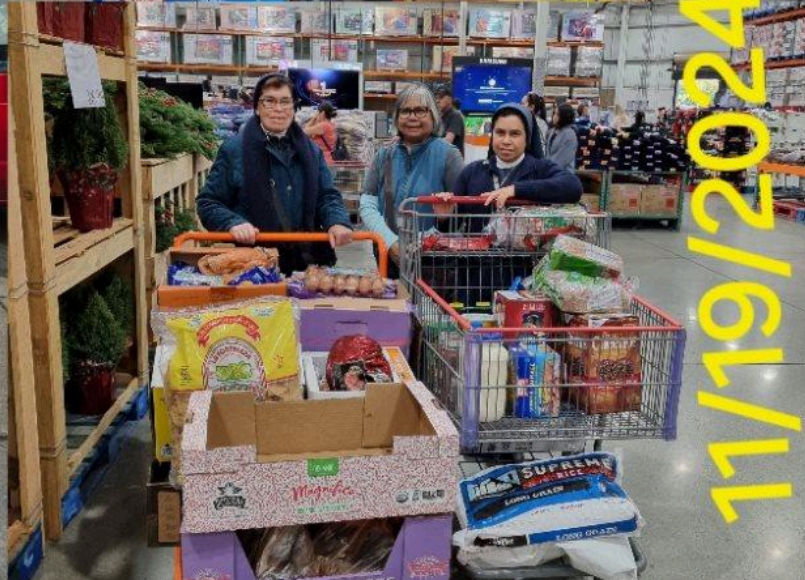
++++++ 11/19/2024, Tuesday. 2 food boxes received for the children that we are helping in Cagayan de Oro island.