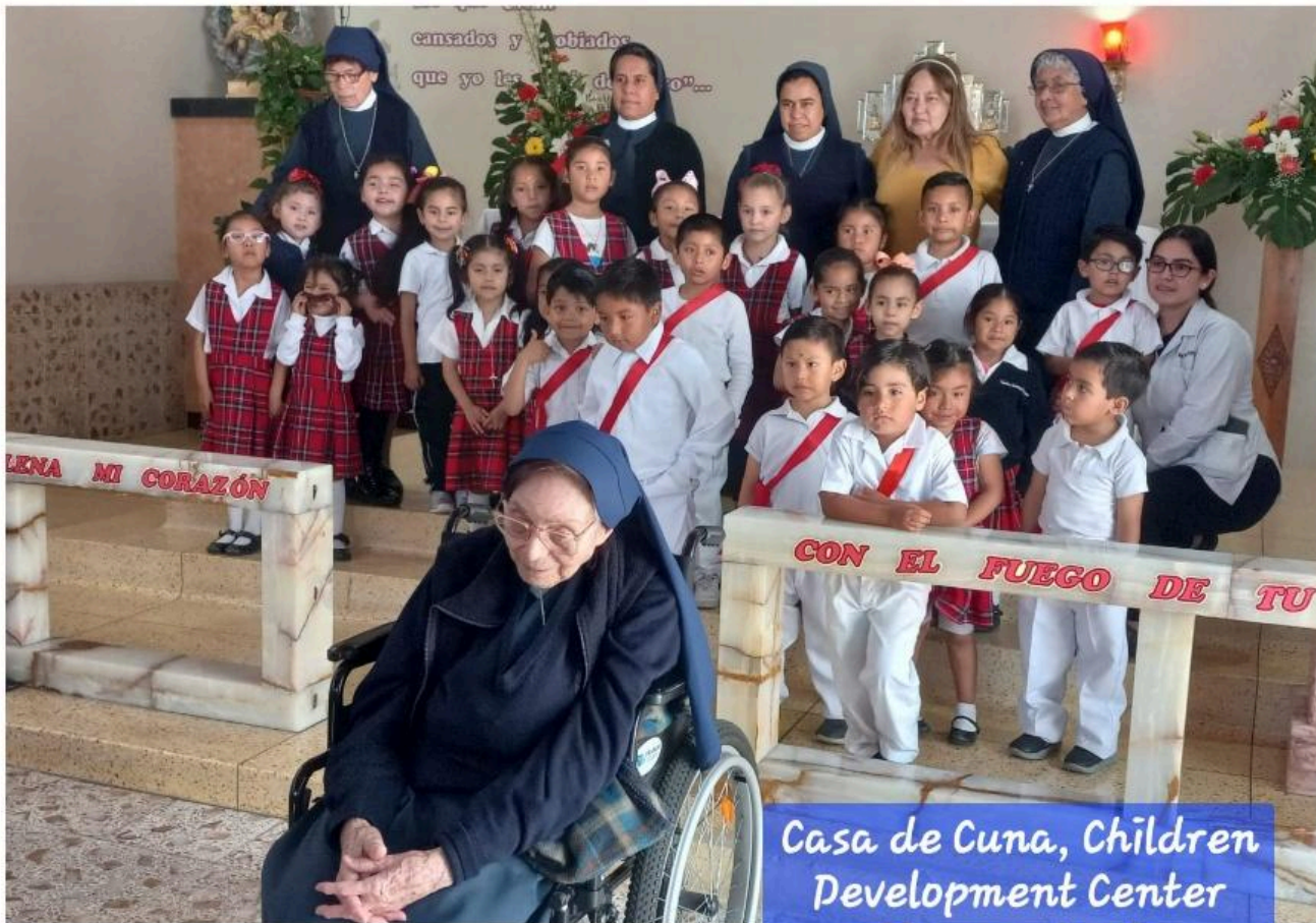
Casa de Cuna, Children Development Center Tijuana, Mexico